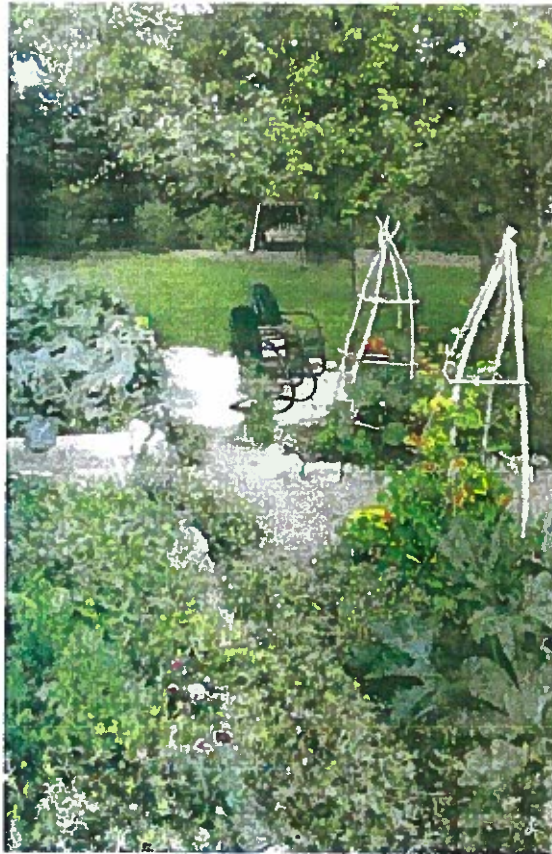
This test garden for Organic Gardening Magazine a baby zuke in the right foreground, "golden" runner beans on the first trellis and fairy winter squash growing around the second bean trellis (there's a potted geranium behind it on our seating area, which is the red that appears to be on the trellis).